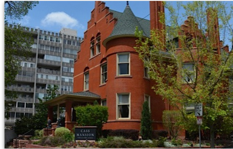
Located in the city and county of Denver, the Capitol Hill neighborhood is bounded by Broadway, Downing Street, Colfax Avenue, and Seventh Avenue.

The history of the Capitol Hill neighborhood encompasses the history of a neighborhood as well as the location of Colorado's most important structure, the State Capitol. For 150 years Capitol Hill has played an important role in the history of the Centennial State. Today, the Capitol with its famous gold dome proudly stands high above downtown Denver and the thriving neighborhood that grew up around it, Capitol Hill. More than just the place where laws are made, Colorado's capitol building is a celebration of the state's history, with innumerable artworks and artifacts that tell the story of the Centennial State.